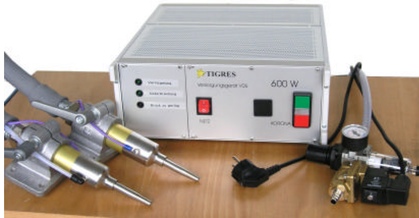
Compact complete station